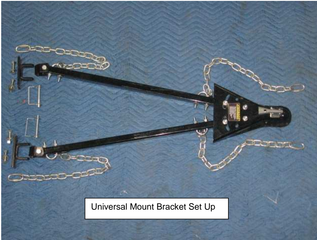
Universal Mount Bracket Set Up