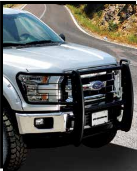
$75 eRewards 3000 Series Grille Guards with Brush Guards