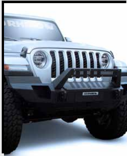
$50 eRewards Front or Rear Trailline Jeep Bumpers