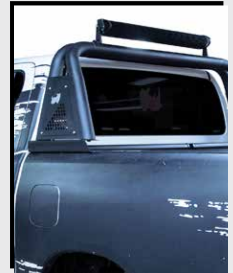
$25 eRewards Sport Bar 3.0