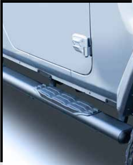
$25 eRewards 4" & 5" 1000 Series Side steps