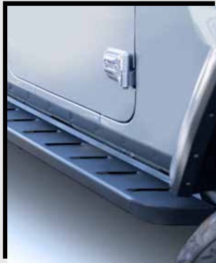
$50 eRewards RB10 Running Boards with or without Drop Steps