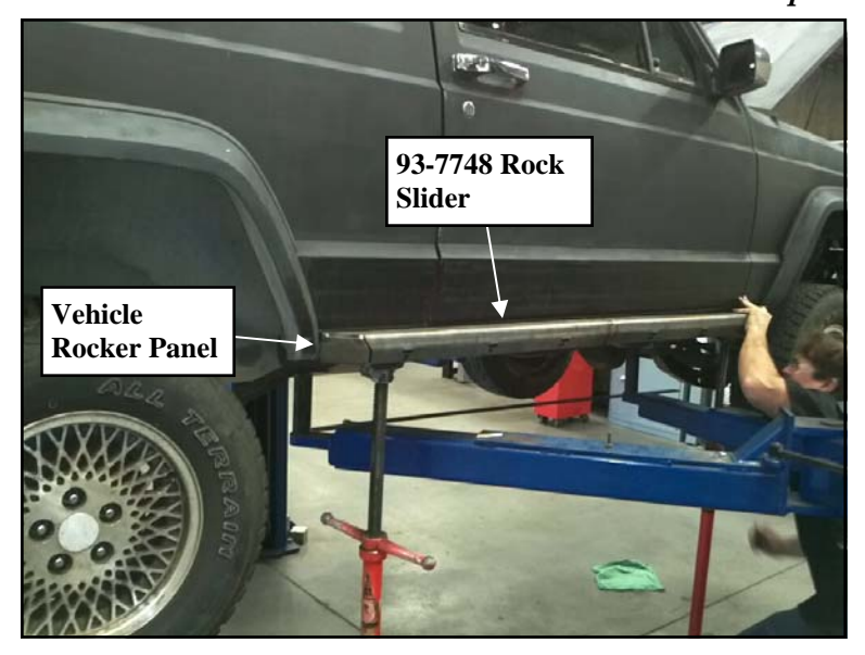
<u>Step 3:</u> Once confident with the slider location on the vehicle, center punch the (6 per side) side mounting hole locations and (4 per side) lower mounting hole locations using the supplied transfer punch (90-4432). (Fig. B)

NOTE: Jacks or similar tools can be used to hold the slider in place.