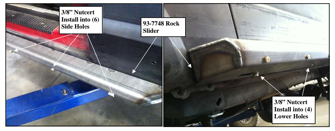
Step 7: Repeat steps 1 through 7 on the passenger side of the vehicle.

NOTE: Be sure to start the bolts by hand to avoid cross-threading them.