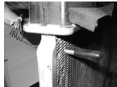
Then push the insulator cap over the end of the sensor.