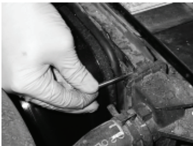
Insert the temp. sensor near the inlet hose...